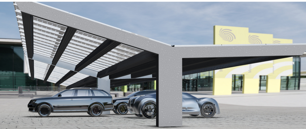
Carport LS-4 - 3/15 degrees inclination

A double structure for north-south orientations